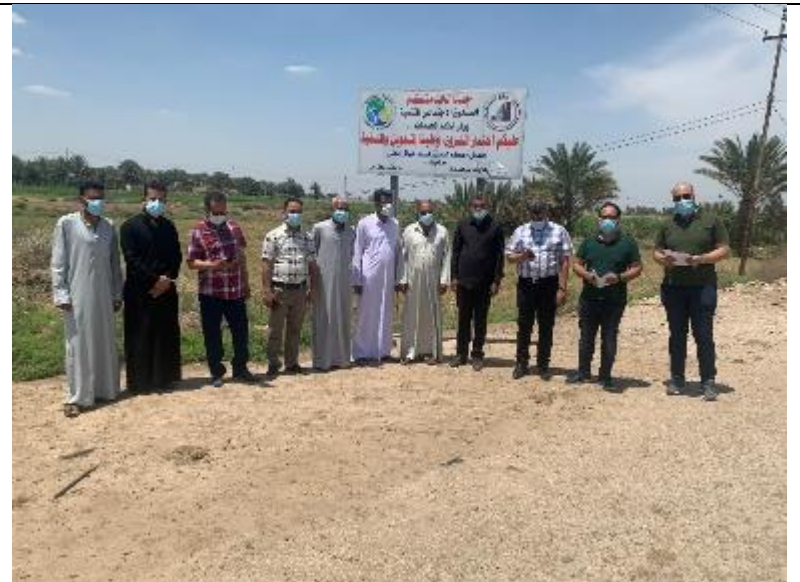
Public Consultations at Albu Marjan Village