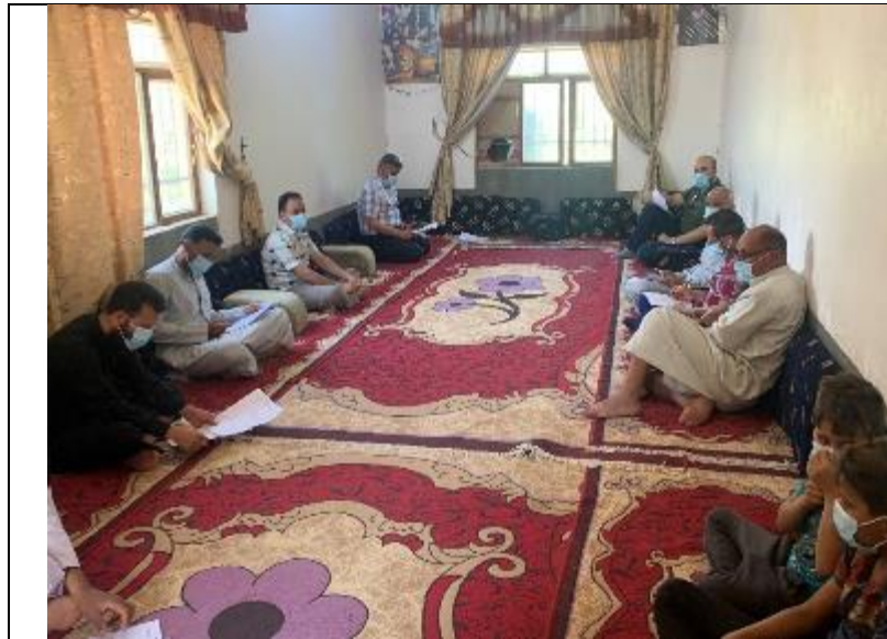
Public Consultations at Albu Marjan Village